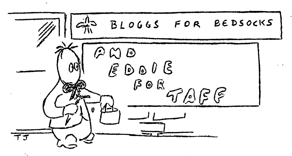
SOSSIES BY TERRY JEEUES